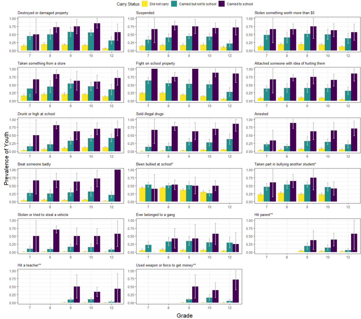
Online Figure 2. Proportion of youth endorsing individual risk factors by handgun carrying status at each grade with 95% CI. Panels are in the same order as represented in Table 1. Note: *Not asked in grade 12; **Not asked in grades 7 and 8