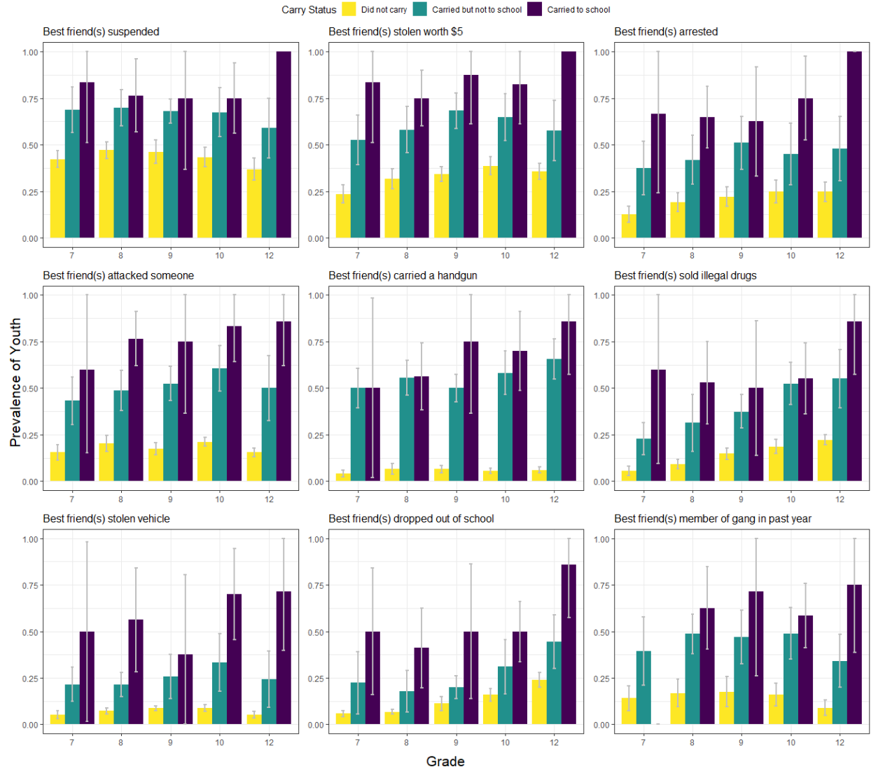
Online Figure 3. Proportion of youth endorsing peer risk factors by handgun carrying status at each grade with 95% CI. Panels are in the same order as represented in Table 1.